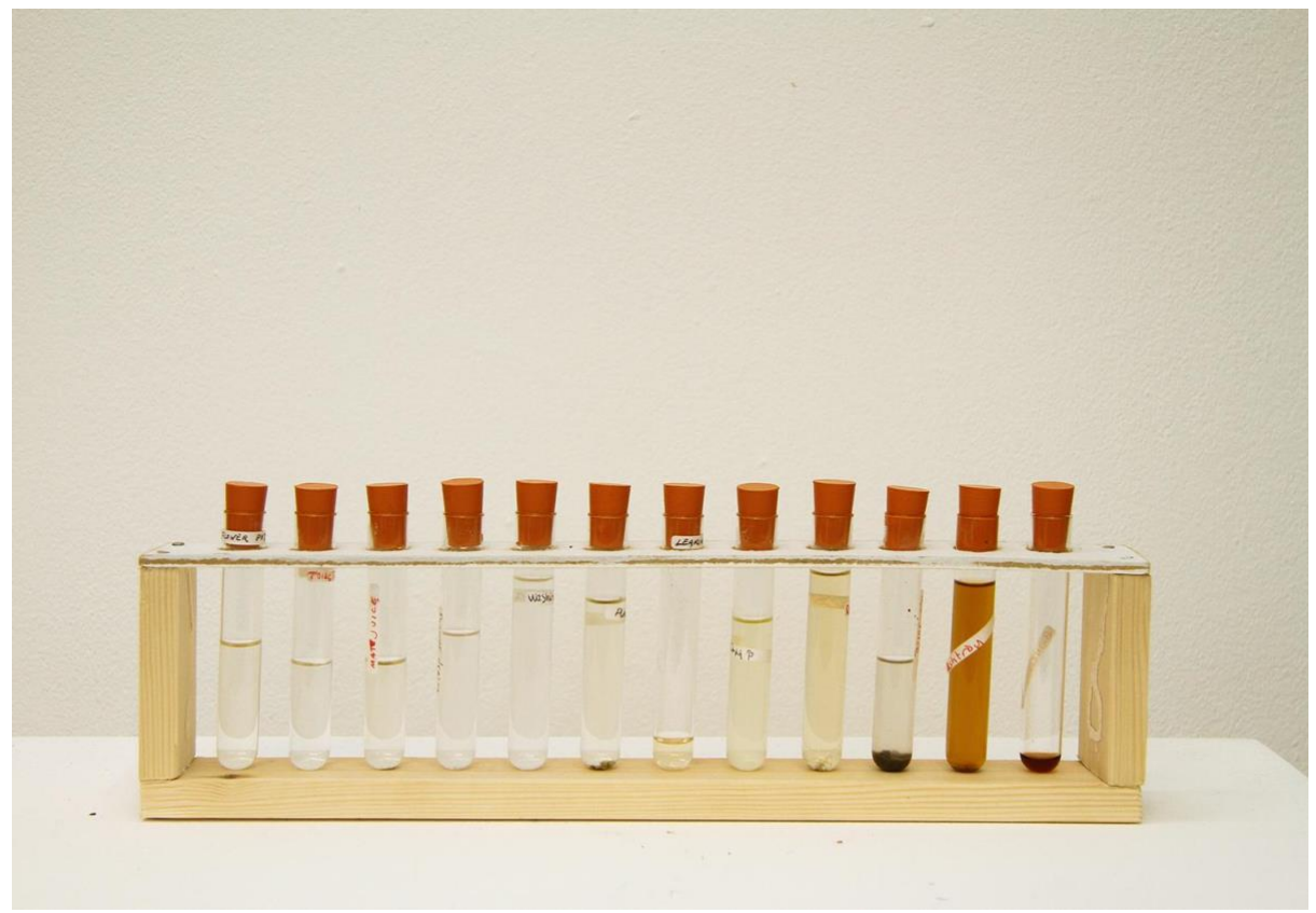
(Collected water samples)

N — E º W "(S) Seasonal School at Jupiter Woods