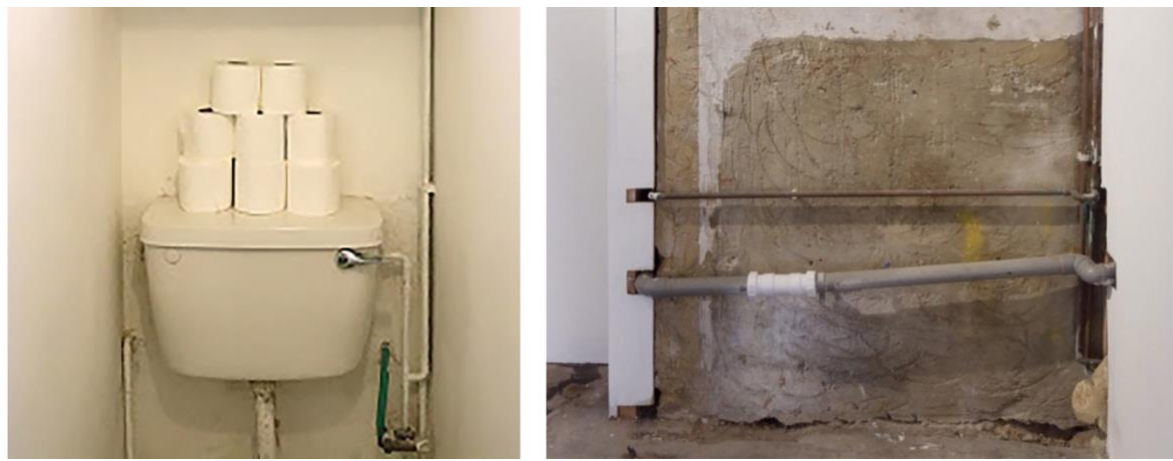
(Toilet and pipes at Jupiter woods)

After introductory readings (details below), participants in this workshop were asked to draw out and imagine sources and movement of water on the Jupiter Woods site. Twelve samples were identified, collected and labelled: